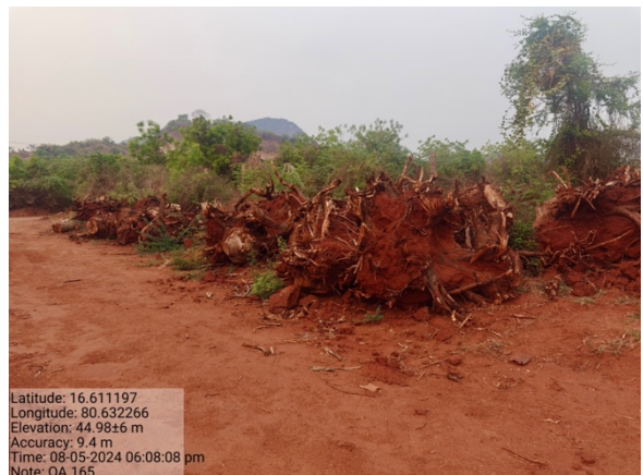
Figure 2: Photographs taken during inspection of site area.