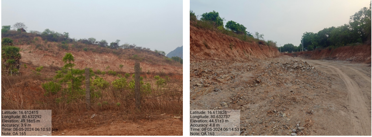
Figure 3: Photographs taken during inspection of site area.